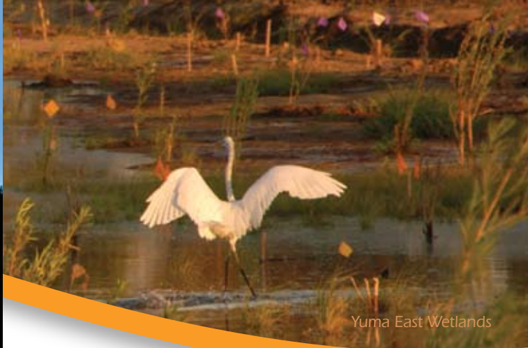
Yuma East Wetlands

Civil Engineering In Harmony with the Southwest